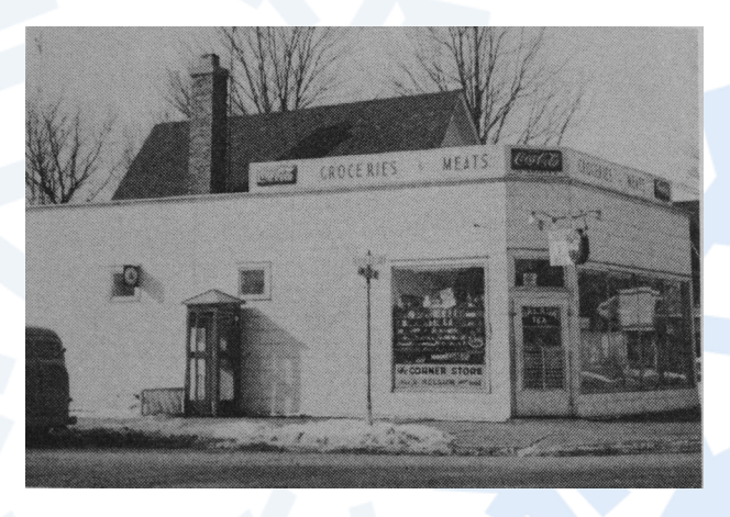
The Corner Store which is now the old Rite Aid building did not have enough pixels to make the book