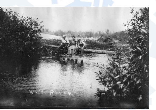
Doc Douglass on the right sitting on a log bridge over the White River