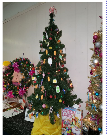
This year's Christmas Silent Auction. Many beautiful trees, wreaths, and other items.

The Friends group and the Lion's Club sponsored a great Christmas Silent Auction and dinner this past December 6th at the Lion's Den in White Cloud. There were over 50 items (decorated trees, wreaths, gift baskets, holiday decorations, and even decorated gnomes available for people to silently bid on. It was great fun. The swiss steak dinner offered by the Lions Club was very good also. If you weren't able to attend this year, plan on doing it next year, since this is an annual event—always the first weekend of December before the White Cloud Christmas Walk activities downtown.